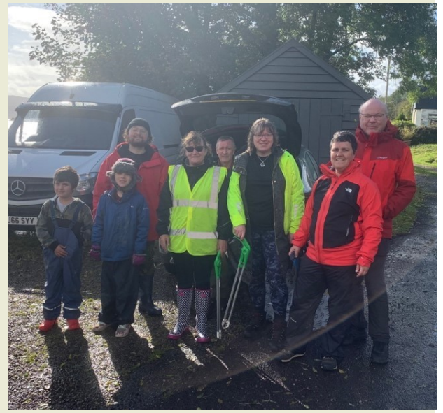
Beach cleaners at the ready!

The Grab Trust donated £250 for this excellent work, which will go towards the upkeep of the Village Hall, Jubilee Garden and shop as well as village activities.